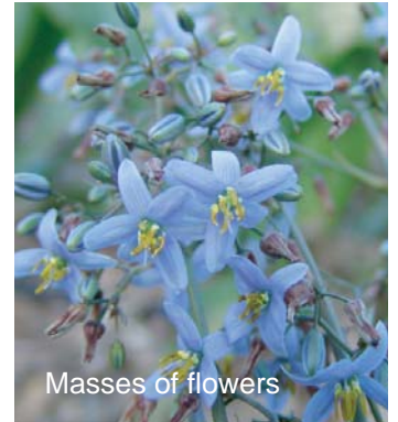
Masses of flowers

In some ways Cassa Blue has the shape of a dwarf Phormium, but it is far tougher. Its blue colour provides great contrast in any garden or landscape design. Avoid wet feet in hot humid areas. (See Specification sheets for your region. www.ozbreed.com.au )