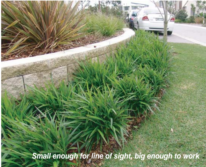
Small enough for line of sight, big enough to work

'Little Jess' only grows to about half the height of many forms of Dianella caerulea ; about 40cm high (high nutrition can make it higher). It is a great commercial and domestic plant. It has excellent humidity tolerance, and good cold tolerance.