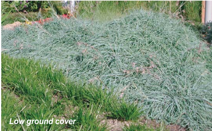
Low ground cover

Themelda 'Mingo' is a blue prostrate form of Kangaroo grass with rusty red/brown semi prostrate seed heads. Flowers over summer months. 'Mingo' has an overall spread of about 600mm in diameter and stands approximately 150mm to 300mm tall. With a little care it looks stunning. With no care it looks a bit raty.