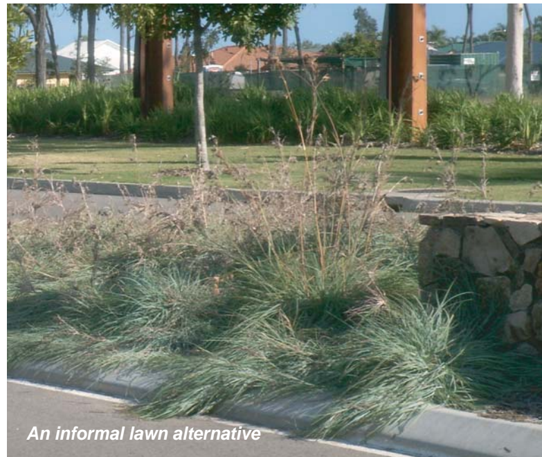
An informal lawn alternative

It is useful on Golf Courses or anywhere where an informal ground cover is needed. 'Mingo' needs an annual trimming of no more than 2/3 of the leaf growth. Avoid Summer or Winter trimming. 'Mingo' can even be trained as a lawn alternative. In drought times, or summer, it benefits from a little water.