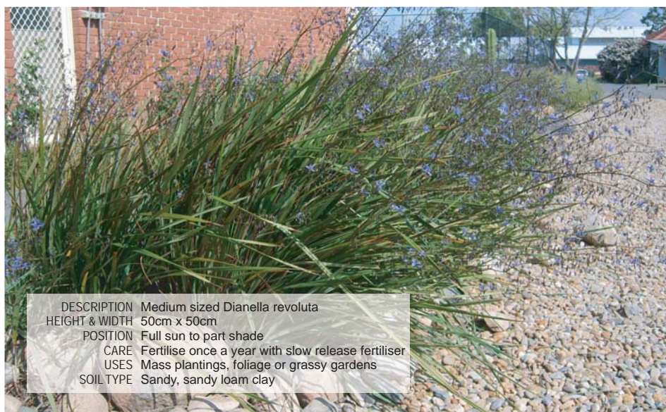
The Dianella revoluta with cleaner foliage & more flowers