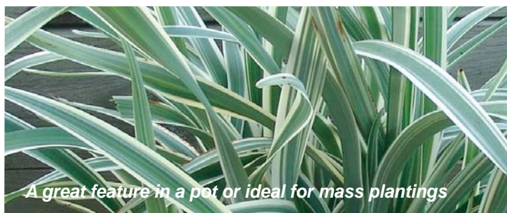
A great feature in a pot or ideal for mass plantings