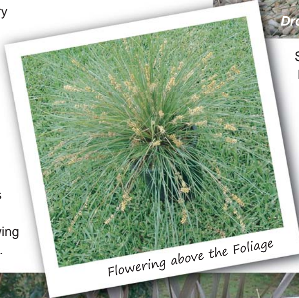
Flowering above the Foliage

Shara has tested well in the humidity of Brisbane and Sydney for 3 years, with so far no sign of death due to root rot and is currently being tested further north. It has also done well in some colder climates and has survived and stayed evergreen in -5°C frosts. So far this is proving to be a good lower growing alternative for Tanika, particularly for more humid climates. It is a smaller size, so we recommend planting at 8 per square metre as a blanket ground cover.