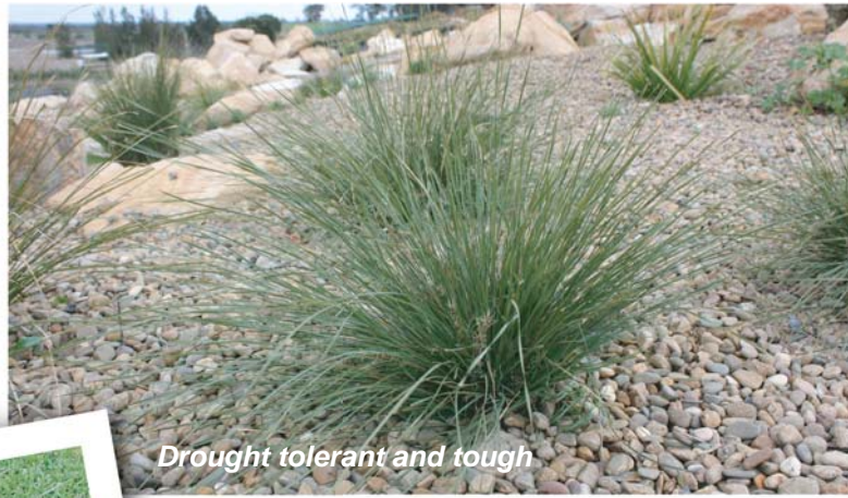
Drought tolerant and tough

Shara is a fine leaf Lomandra with slight blue grey tones. It grows to about 400mm high with a spread of about 500mm. Common Lomandra fluviatilis grows significantly higher. Shara is very Phytophthora tolerant. It can tolerate periodic wet feet, but not permanent wet. It is also very drought tolerant. Shara has more flowers than most forms, and its flowers sit well above the foliage. It also keeps its colour in heavy frosts. It is an ideal choice for mass planting where a low growing tidy tough plant is needed.