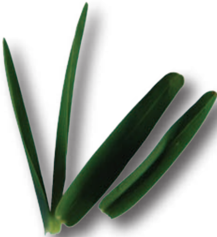
Sapphire (left) has a finer leaf in comparison to other Buffalo varieties (right)

Sapphire has the vigour of a young vibrant breed and establishes extremely well. Sapphire soft leaf Buffalo was bred in Australia from the older Australian variety of Sir Walter Buffalo turf. Next generation Sapphire looks so much better and finer textured than other varieties. Sapphire is easily as good as any other Buffalo in performance. Sapphire - performance and good looks at a better price.